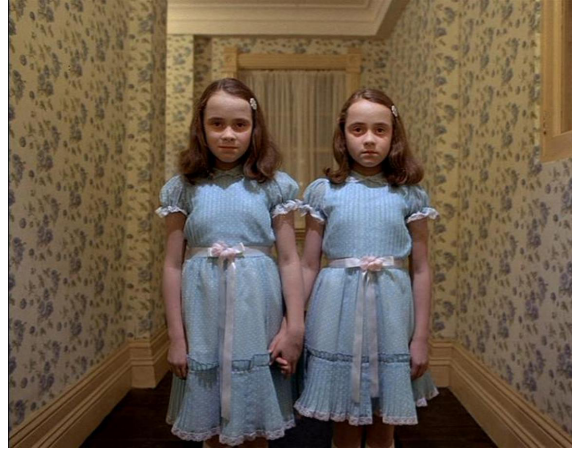
The Shining, 1980