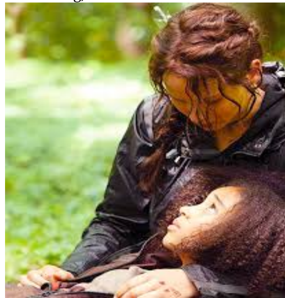
The Hunger Games, 2012