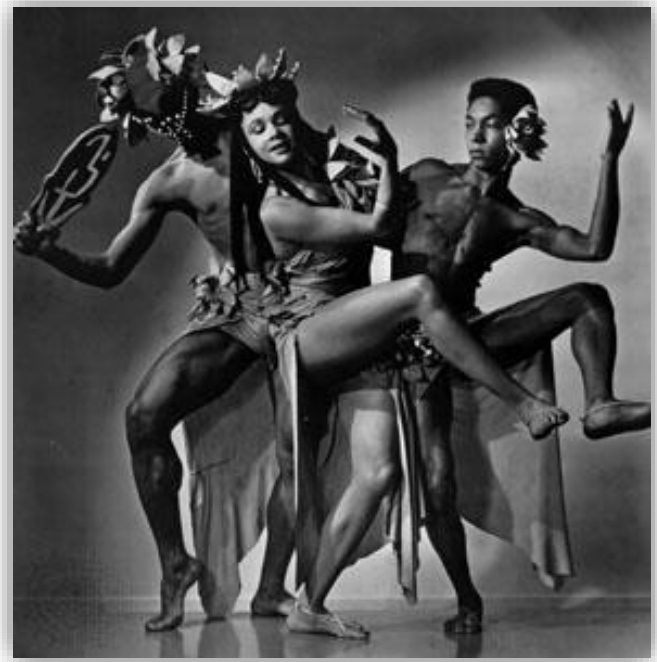
Katherine Dunham, Tropical Revue , 1943

Formal Essay —Towards the end of this semester, you will write a short formal paper, in which you examine and critically assess an African American novel using the theoretical approach of either Henry Louis Gates or Toni Morrison. A detailed guideline for this assignment is available on blackboard.